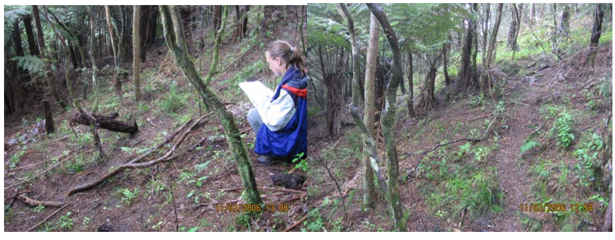
Figure 3: Plot 2. Covenanted Fenced Area

Plot 2 was located in the covenanted fenced area. This area has been fenced since 1999 (approximately 7 years from the date of data collection). While the fence excludes cows and sheep, feral goats still enter the area by jumping over the fence. This forest consists of Kunzea ericoides canopy trees 10 - 15 m tall and Cyathea dealbata & Cyathodes fasciculata mid-story trees 3 to 6 m tall. The ground covering was relatively bare, but there were many small shrubs <50 cm in height emerging. Selaginella kraussiana was present, but not as prevalent as in the unfenced plot (Figure 3).