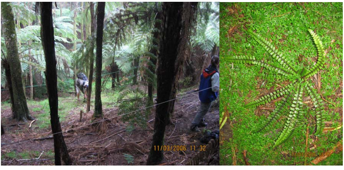
Figure 2: Plot 1. Unfenced and Uncovenanted Area Open to Grazing

In general, Plot 1, the uncovenanted unfenced area, was found to have been grazed by cows, sheep and feral goats. The canopy consisted of kanuka ( Kunzea ericoides ) trees 10 - 15 m tall. The mid-story trees were silver tree fern ( Cyathea dealbata ) and were 3 to 6 m tall, while the ground covering was very bare with few small shrubs mostly under 50 cm tall. Many of these shrubs have been grazed upon several times, therefore indicating a preference for browsing. Where there was some groundcover, it seemed to be dominated by the non-native species Selaginella kraussiana (Figure 2).