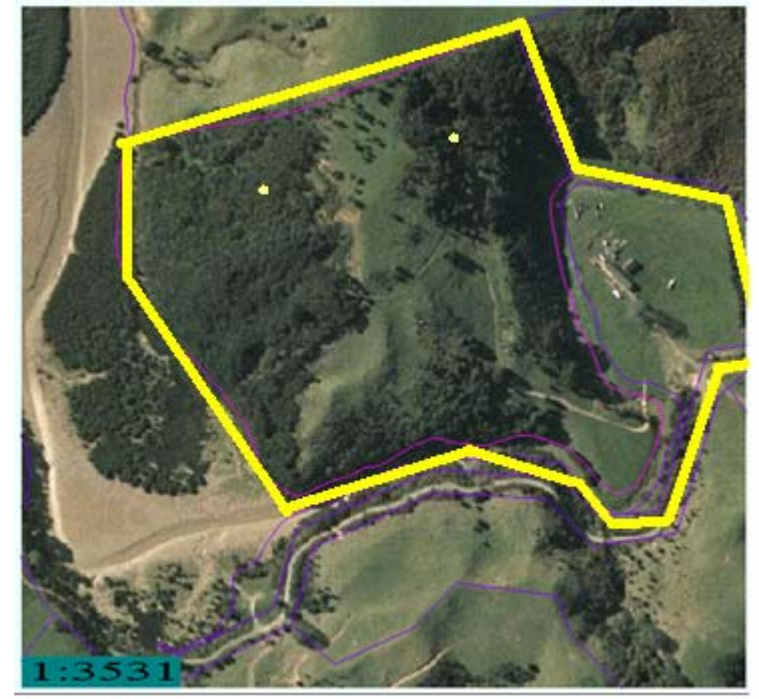
Figure 1: Aerial View of Waingaro Property and Plot Locations.

An aerial view of the property was acquired to aid with plot selection (Figure 1). The property boundary in Figure 1 is represented by the thick line. The wide barren patch to the left of the property boundary is the mouth of the Waingaro River as it enters the Raglan Harbour. The forested area between the left boundary and the river is a mangrove swamp and the covenanted area is the forested area in the left portion of the boundary. This is the only fenced area inside this location.