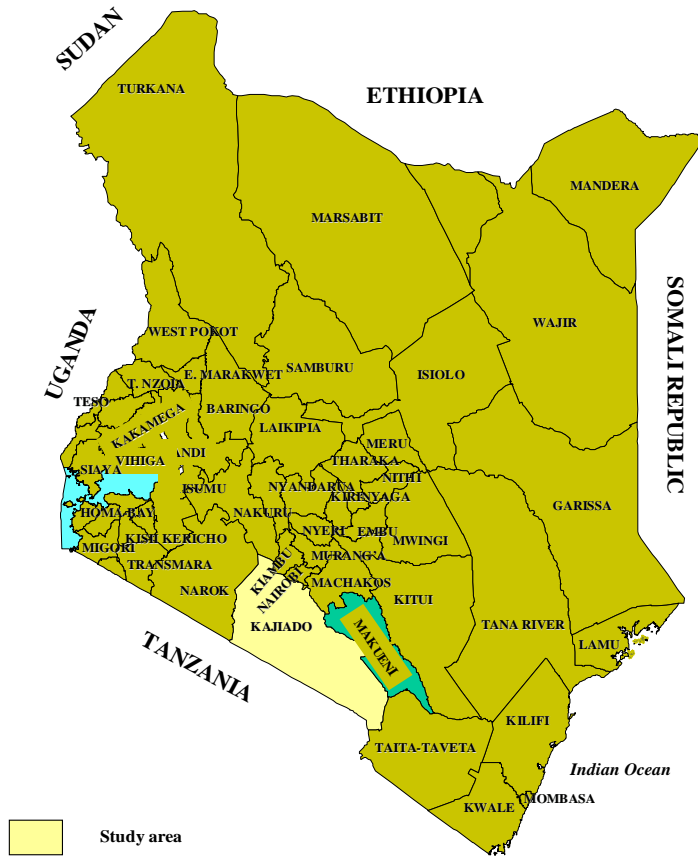
Figure 1. Geographical region where the study was done.