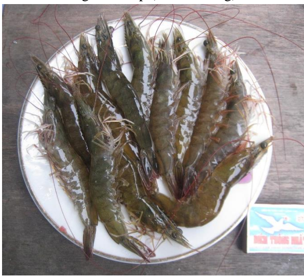
Tiger shrimp (7-10cm long)