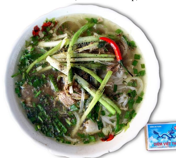
Breakfast (beef noodle soup)