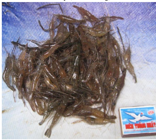
Shrimp (3-5 cm long)